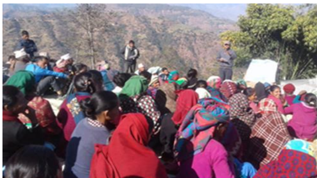
VDC level Interaction in Khara, Rukum