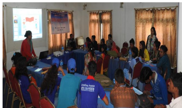
District Level Youth Club Training at Nepalgunj