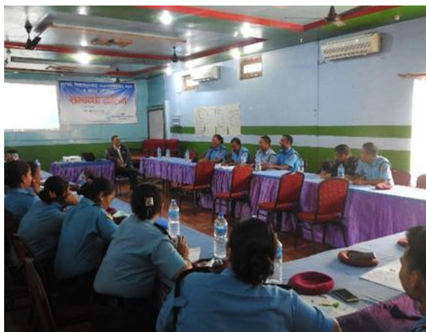
Security Personnel Training in Nepalgunj