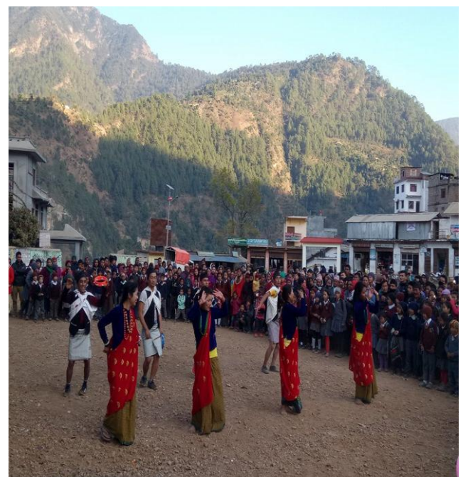
Interculture Harmony in Rolpa