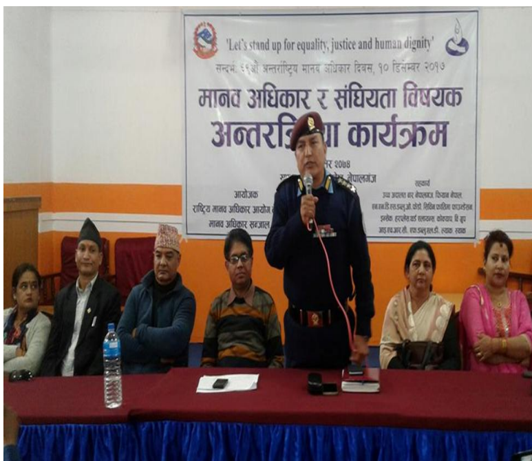
Interaction in HR Day in Nepalgunj