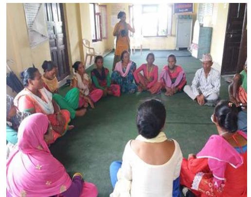
TJPF meeting in Banke