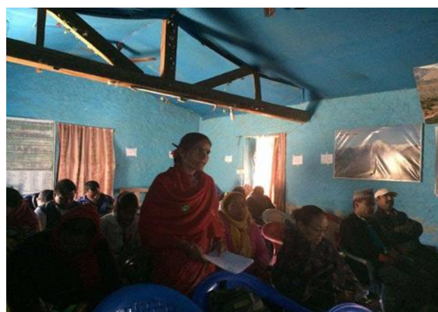
District Level Dialogue for conflict victims in Nepalgunj