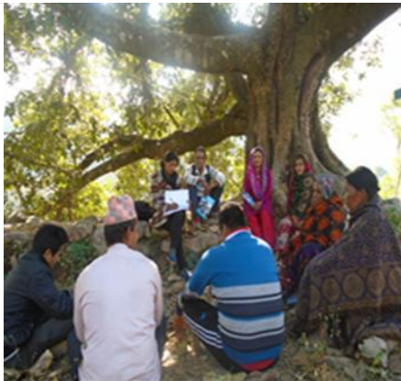
TJPF meeting in Pyuthan