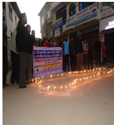
Lightening in HR Day in Pyuthan