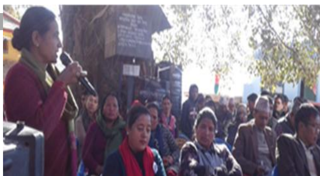
HR Day in Rukum