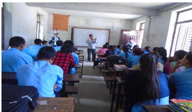
Joint Monitoring in Pyuthan District