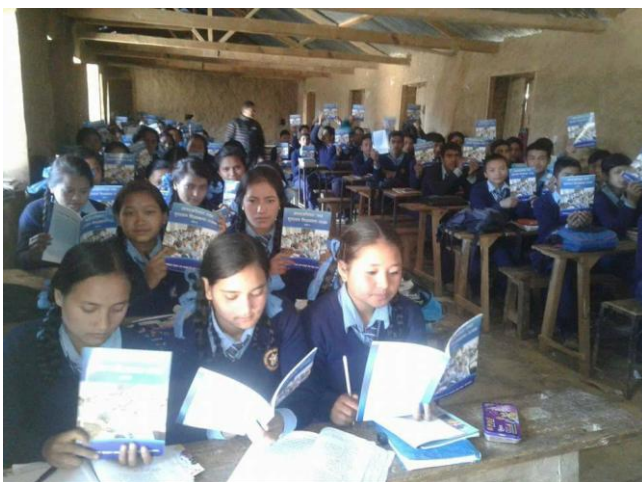
Rolpa Peace education Krishna Ma. Vi. Gharti Gaun, Rolpa