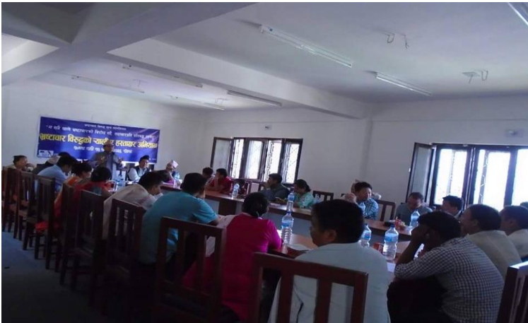
Interaction in enforced disappearance